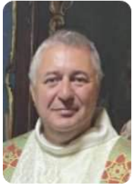
Penha de França Chapel, Funchal "Lord, you know everything; you know that I love you." (John 21:17)